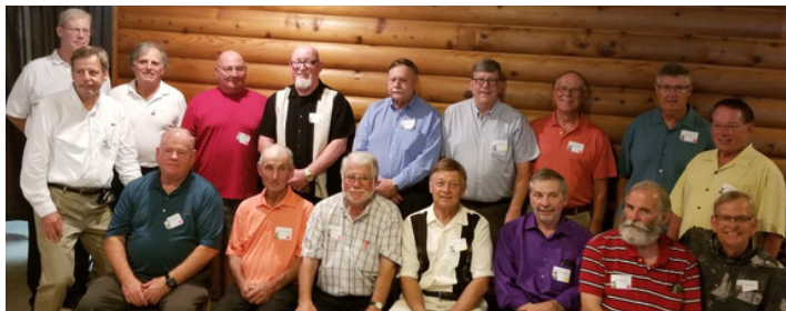
ALUMNI REUNION CLASS OF 1967