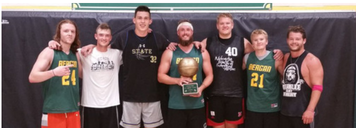
ALUMNI BASKETBALL TOURNAMENT CHAMPIONS